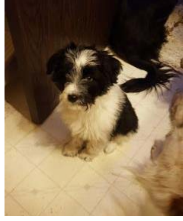
Zag at 2 months old

Submit your pictures and story of the little one you adopted .